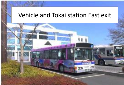
Vehicle and Tokai station East exit