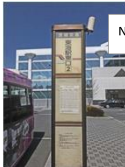
No. 2 bus stop (Tokai Station East Exit)