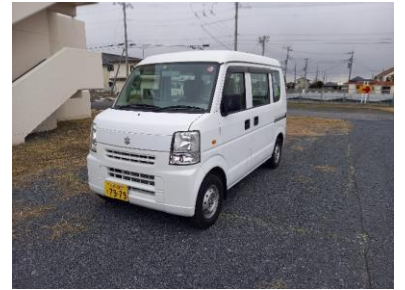
軽自動車 (4人乗り) スズキ エブリイ