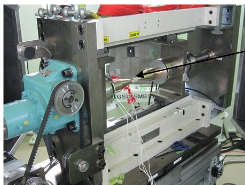
cylindrical rock sample