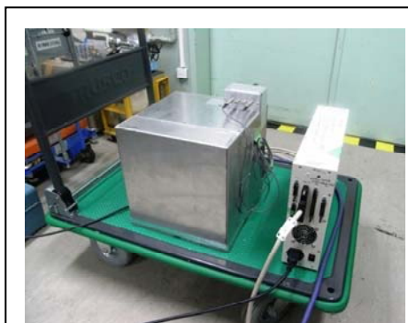
Figure 1 A first test detector for “SENJU” instrument delivered just a week before the June run.