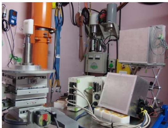
Figure 2 Experimental setup at the BL10.